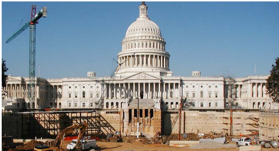
Excavation Support Wall Looking West

The CVC will include space for exhibits, food service, two orientation theaters, an auditorium, gift shops, security, a service tunnel for truck loading and deliveries, mechanical facilities, storage, and much needed space for the House and Senate. When completed, the CVC will preserve and maximize public access to the Capitol, while greatly enhancing the experience for the millions who walk its historic corridors and experience its monumental spaces every year.