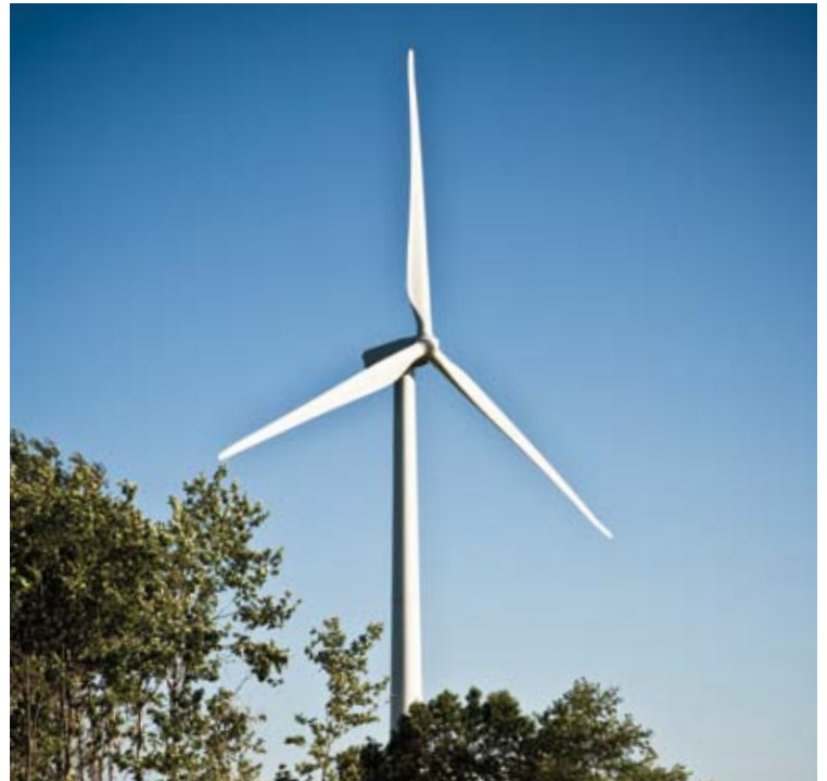
Casselman Wind Power Project, Somerset, PA

At coal-fired power plants across the country, Nicholson has installed thousands of micropiles for foundations for new Selective Catalytic Reduction (SCR) units, which are large pieces of emissions control equipment that reduce nitrogen oxide (NOx) emissions. Micropiles are often the foundation of choice for SCR units and other power plant equipment such as scrubbers and flue gas desulfurization units. Because vibration and impact to adjacent structures are minimal during installation, micropiles can be installed in limited-access areas such