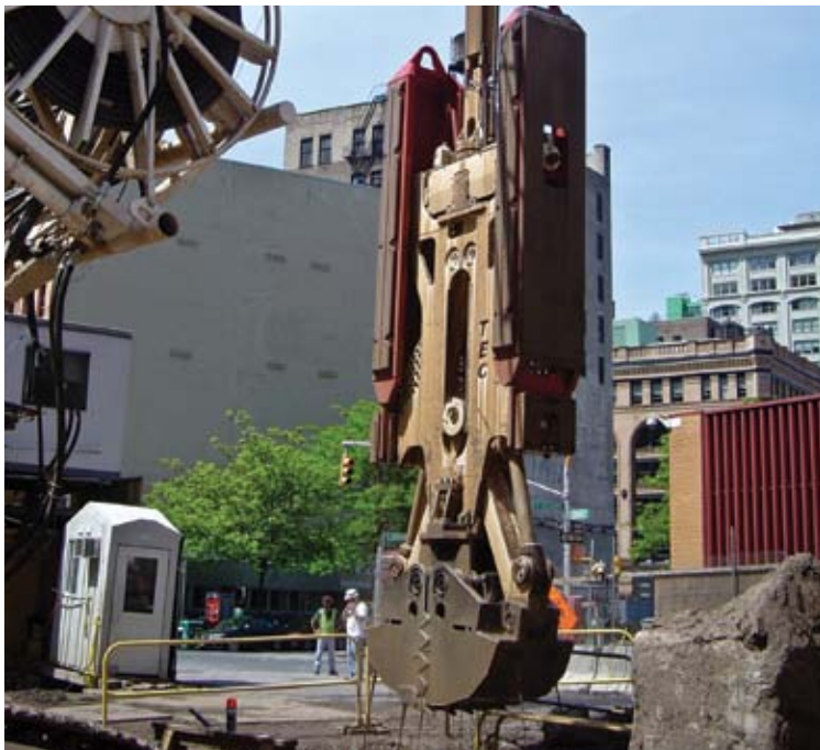
New York Law School, New York, NY

Using a hydraulic grab designed by Soletanche Bachy subsidiary TEC, Nicholson constructed a 65,000-square-foot diaphragm wall for excavation support and the perimeter foundation in an extremely tight work area. Forty-four barrettes were installed for interior column support.