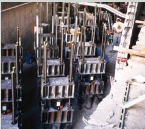
Pile and jacking frame system

As hotel construction neared completion, engineers determined that the building was settling approximately \frac{1}{2} of an inch per week. To arrest settlement, Nicholson designed and installed over 500 micropiles, each approximately 200 feet deep. Each pile connected to the structure's mat foundation with a jacking system.