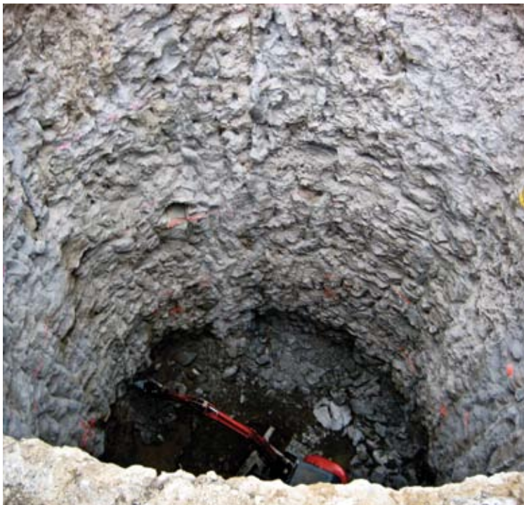
Miamitown Interceptor Sewer, Miamitown, OH

Nicholson constructed a 29-foot diameter, 61-foot deep shaft using overlapping jet grout columns. Work also included the installation of a 20-foot thick bottom plug using jet grout columns.