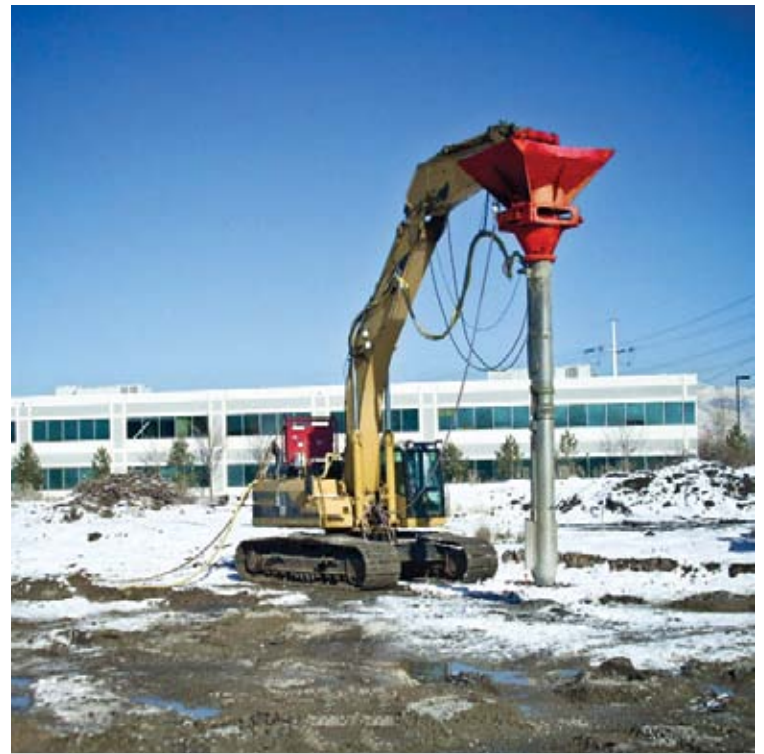
Sorenson Building #8, Taylorsville, UT

Enhanced quality control on cement grouting projects is available through GROUT I.T., our real-time computer monitoring system. The Soletanche Bachy Group has been a leader in electronic monitoring systems for geotechnical processes since the mid 1980s.