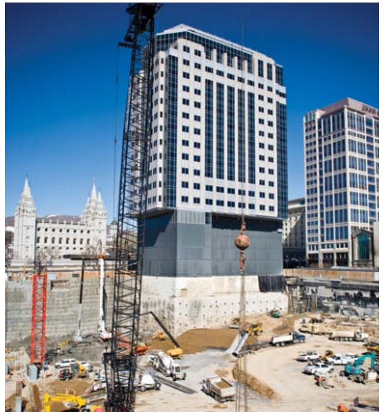
City Creek Center - Block 76, Salt Lake City, UT

Earth retention systems are constructed to provide support where excavations are made or slope stability is compromised.