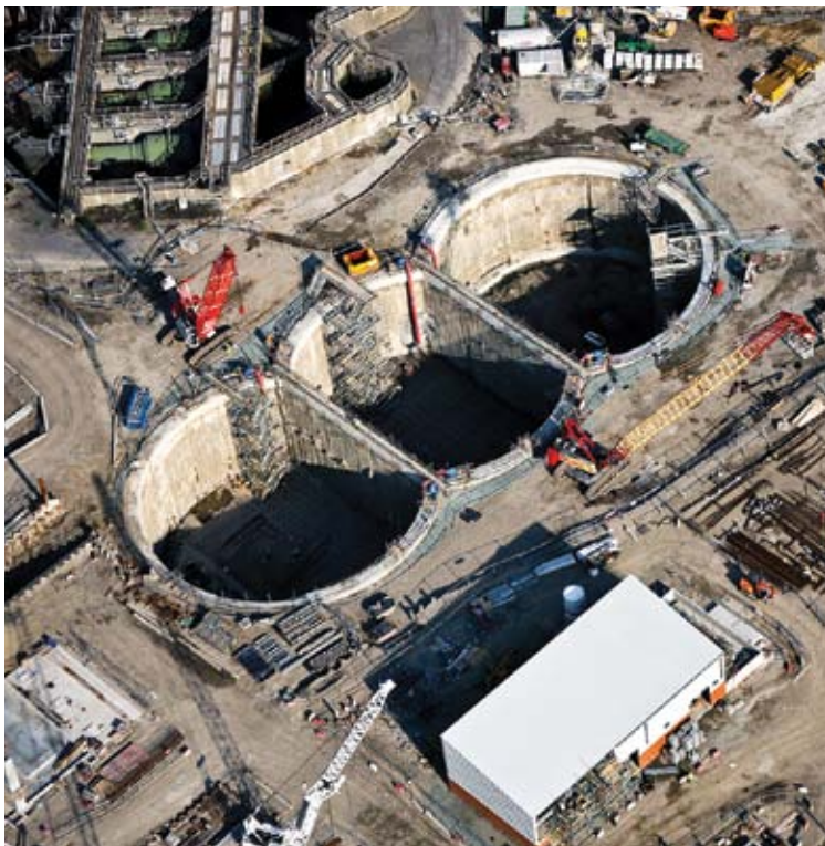
Isle of Grain Pump House, Kent, UK

Bachy Soletanche constructed a series of uniquely shaped diaphragm walls for this underground pump house.