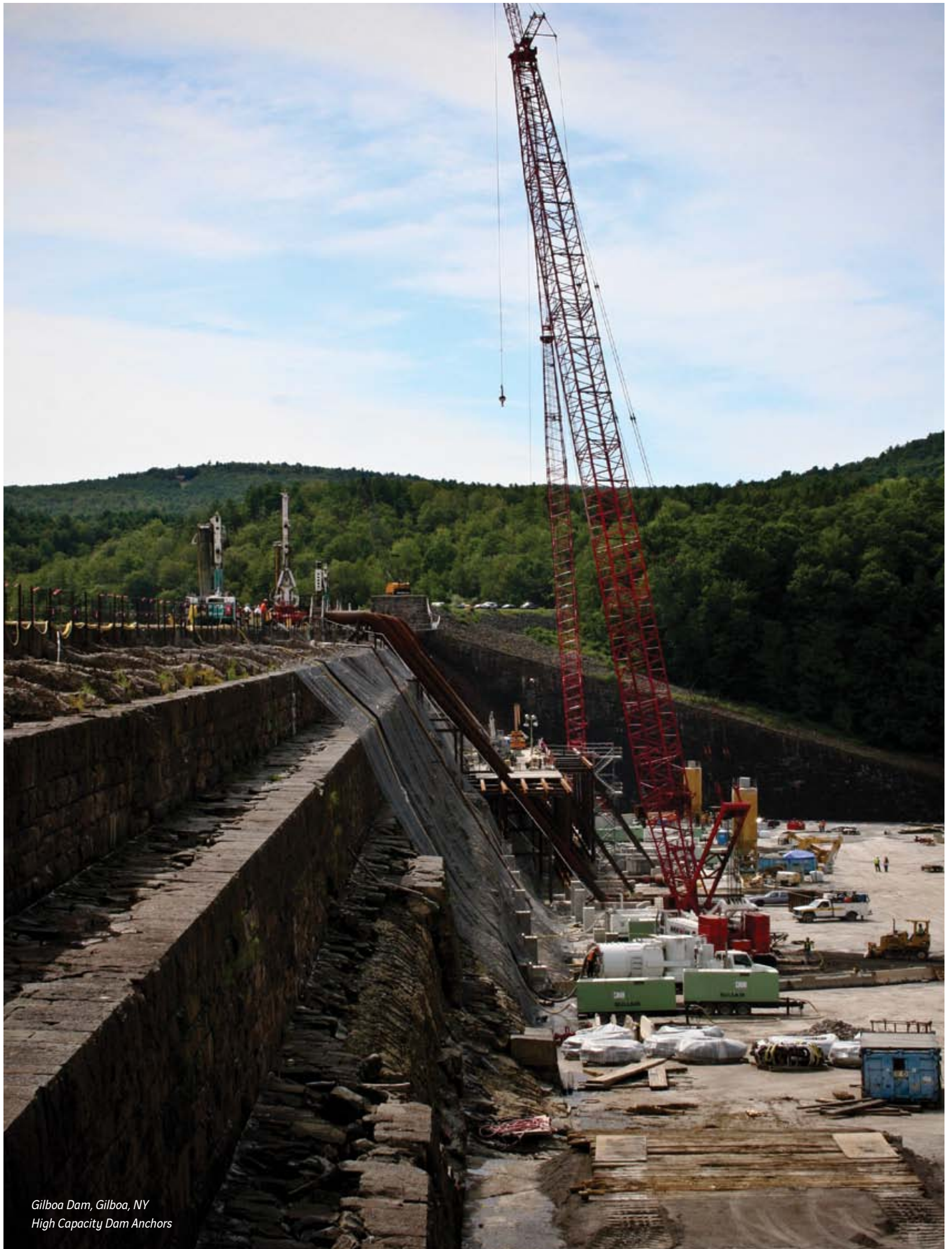
Gilboa Dam, Gilboa, NY High Capacity Dam Anchors