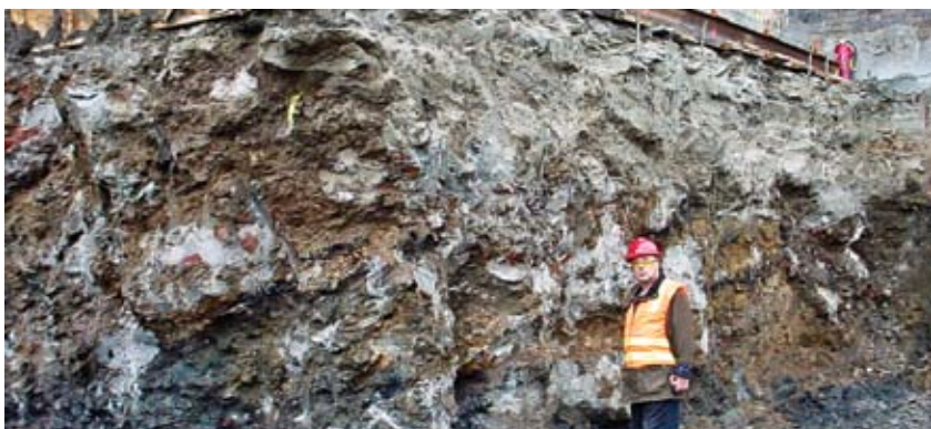
Department of Sanitation Garage, New York, NY

Nicholson is a recognized leader in the use of highly efficient and cost-effective ground improvement techniques. Stone columns and vibro-compaction provide an intermediate foundation system when subsurface materials have inadequate bearing capacity, produce unacceptable settlements, or are liquefiable.