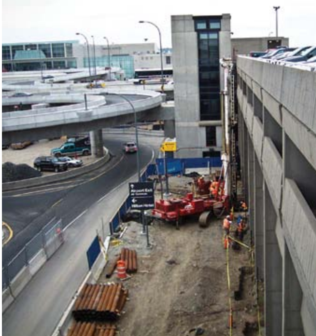
Logan Airport Expansion, Boston, MA

Nicholson, in a joint venture, installed nearly 800 micropiles for the addition of two new levels to the Central Parking Garage at Boston's Logan International Airport. Many of the piles were installed in limited access and low headroom conditions.