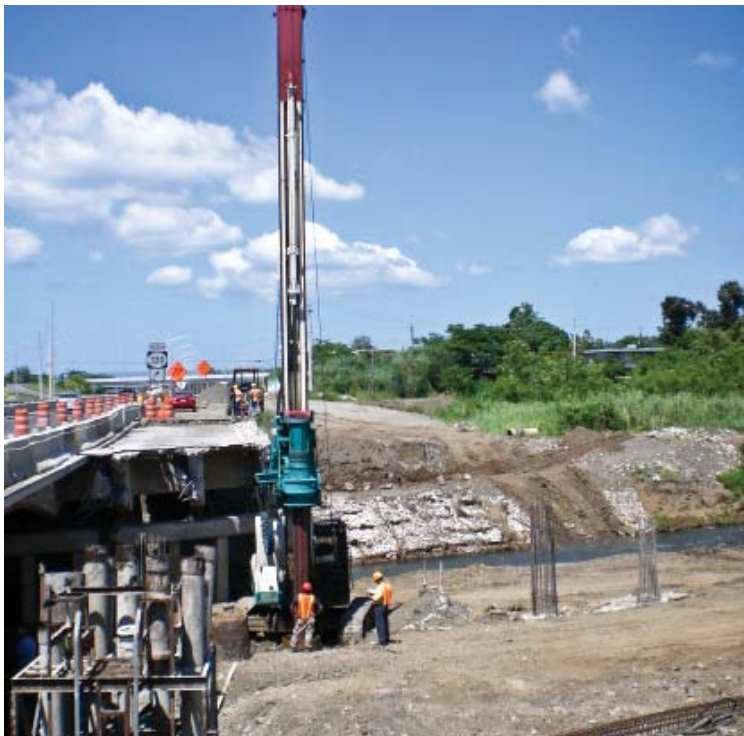
Replacement Bridge Number 791 Over Duey River, San German, PR

Nicholson installed 33 drilled shafts for the foundation of a new bridge in western Puerto Rico. The drilled shafts are 36 inches in diameter and reach depths of 40 feet.