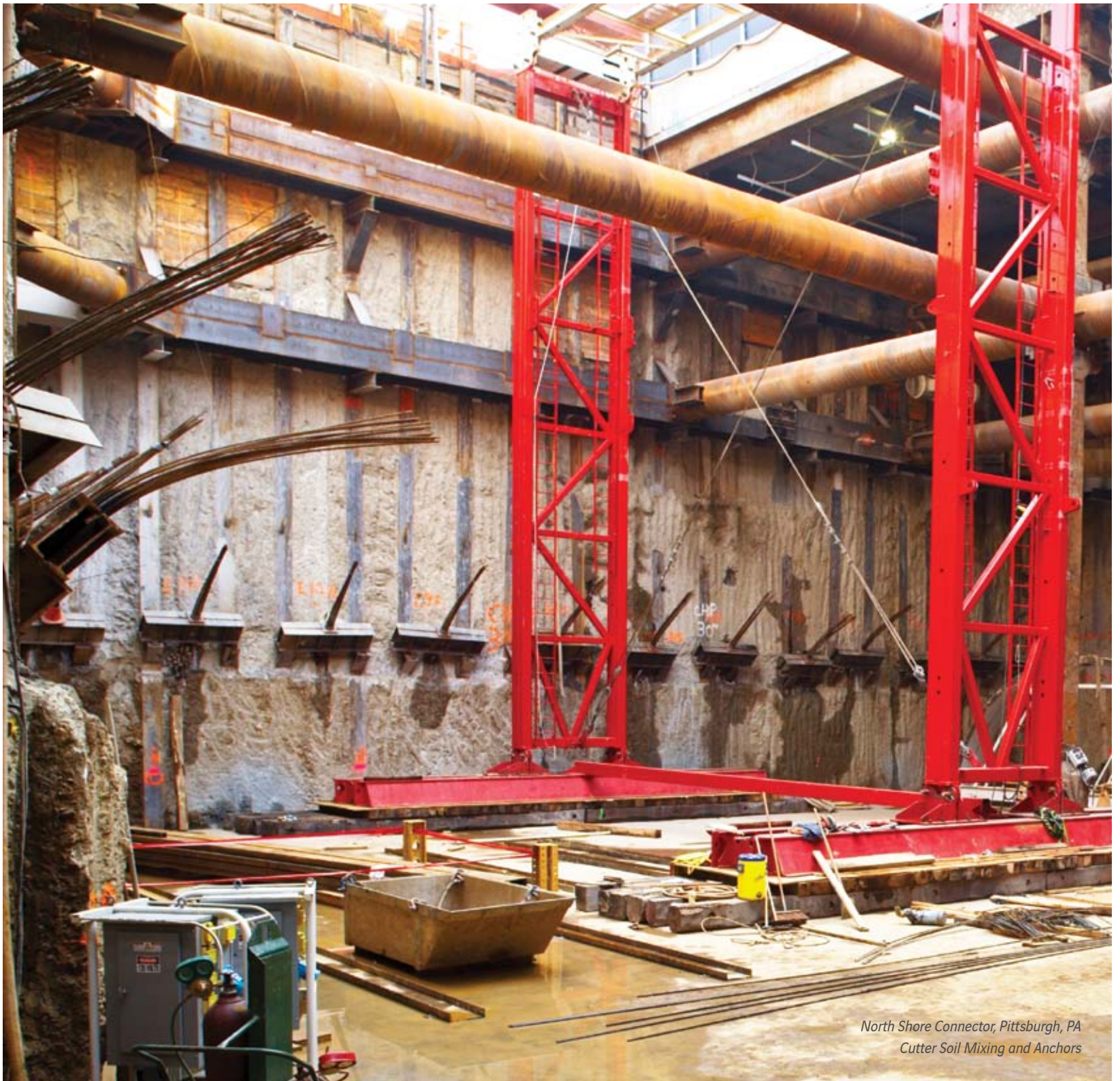
North Shore Connector, Pittsburgh, PA Cutter Soil Mixing and Anchors