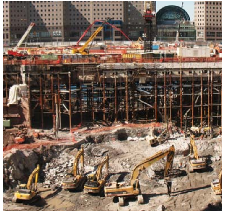
World Trade Center Transportation Hub, New York, NY

Nicholson installed 550 micropiles through and adjacent to an active New York City Transit Authority subway line to underpin the structure as excavation proceeded below. The project also included anchor installation and jet grouting.