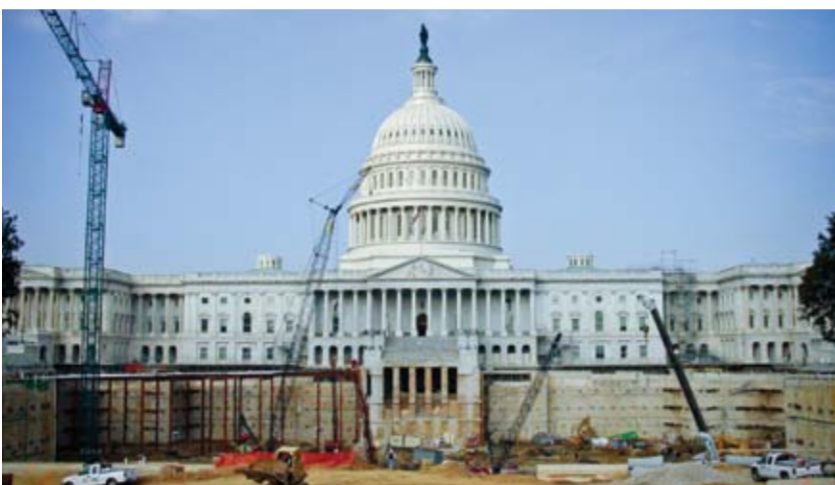
U.S. Capitol Visitor Center, Washington, DC

For both stone columns and vibro-compaction, a vibrating probe suspended from a crawler crane or an excavator penetrates the soils until reaching the required depth. Soil that has been displaced laterally by the vibroprobe is replaced with stone to build a stone column or with in situ material for vibro-compaction.