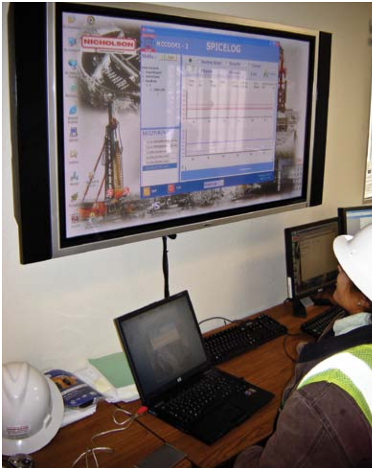
McCook Reservoir, Chicago, IL

Expertise in Dams, Levees, Combined Sewer Overflows, Utility Tunnels, Reservoirs, and Waterways